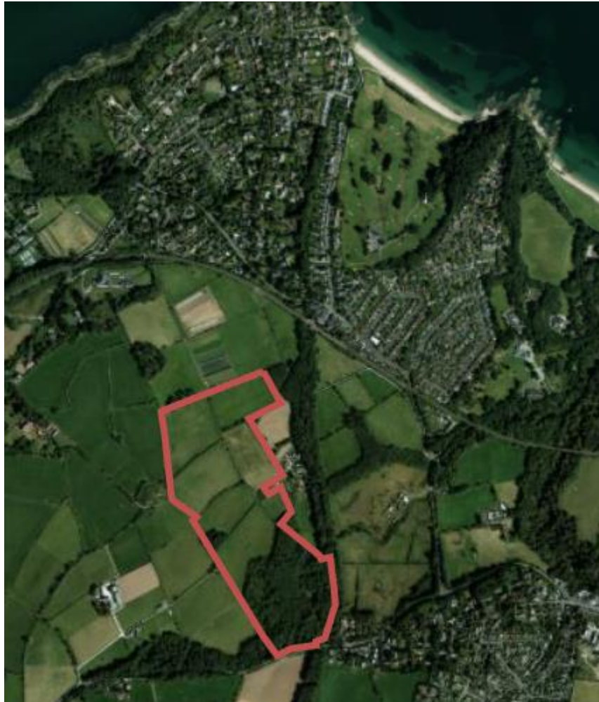
Aerial image of Helen's Bay with limited scope for expansion given extent of existing housing already built out within the settlement. Subject lands outlined

We disagree with the above strategy as it is considered that to deliver the required housing a greater allocation should be allocated to Helen's Bay. Helen's Bay has the capabilities to accommodate additional housing growth and the Council should revisit the settlement limits and identify additional lands to be zoned for housing.