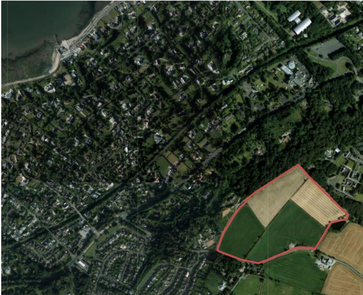
Aerial image of Hollywood with limited scope for expansion given extent of existing housing already built out within the settlement. Subject lands outlined

We disagree with the above strategy as it is considered that to deliver the required housing a greater allocation should be allocated to Hollywood. Hollywood has the capabilities to accommodate additional housing growth and the Council should revisit the settlement limits and identify additional lands to be zoned for housing. The draft plan sets out an allocation of an additional 45 dwellings for Hollywood in order to provide a housing allocation of 398 units. This is directly comparable with Portaferry which has also been allocated the same figure of 398 units. Hollywood occupies a prime strategic position capable of providing a location that is well connected with Belfast City Centre, Belfast City Airport and the primary settlement of Bangor along with other villages along the railway line.