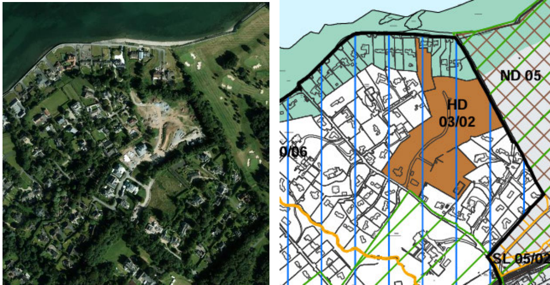
Existing committed site previously zoned under BMAP

It is considered that the Council should investigate the potential for additional lands to focus additional housing close to public transport links including the railway line between Bangor and Belfast.