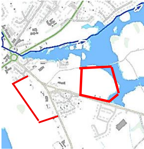
DFI Rivers - Strategic Flood Map

4.1 It can clearly be seen that both parcels of land relate well to existing development and the urban form. The lands at Moss Road are essentially a notch in the urban form, with development zoned or underway to the west and south. Importantly, apart from small areas on the site margins, these lands are not within an area which is subject to flooding, as confirmed by the Strategic Flood Map extract below: