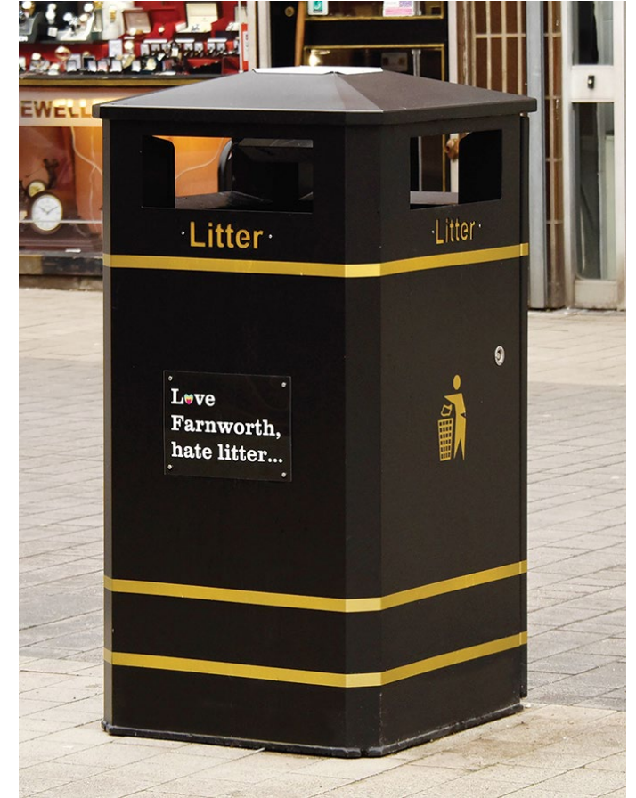
Bins to match existing bins