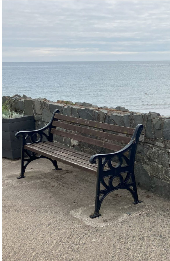
Existing Seating – to be treated