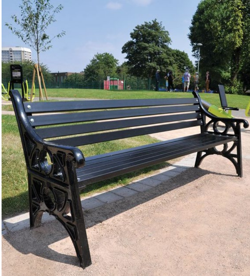
Proposed benches to match existing benches