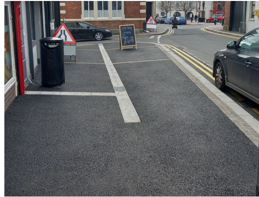
Asphalt resurfacing of pedestrian pathways where required