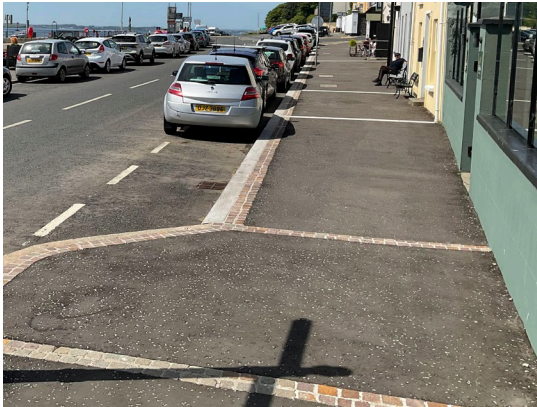
Granite Paving Band Setts 100 x 100 x 80 mm Colour: Buff and brown

Wider bands at crossings with narrower bands along the Main Street