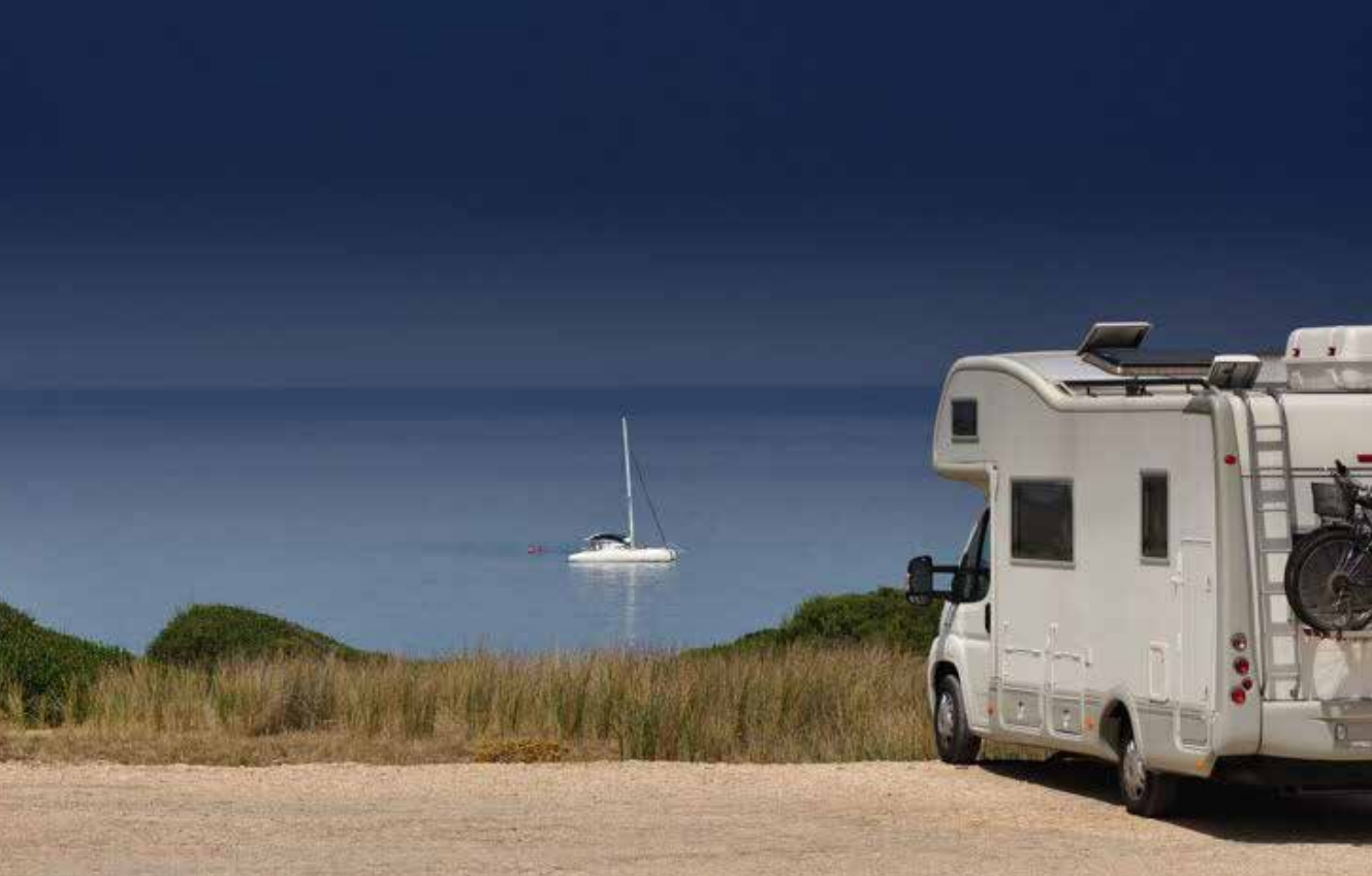
AIRE DE SERVICE CARPARK