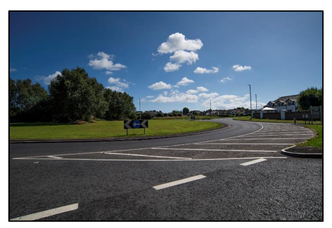
Groomsport Road Roundabout, Groomsport