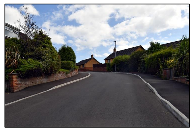
Culmore Avenue, Newtownards