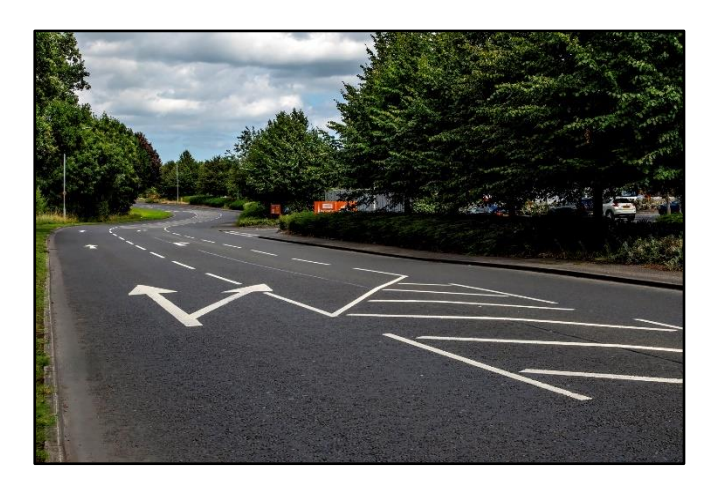
Airport Road West, Holywood