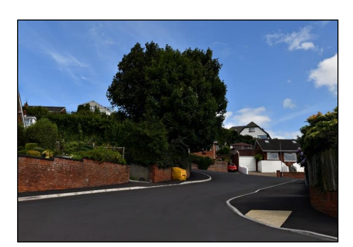
Slieve Croob, Newtownards