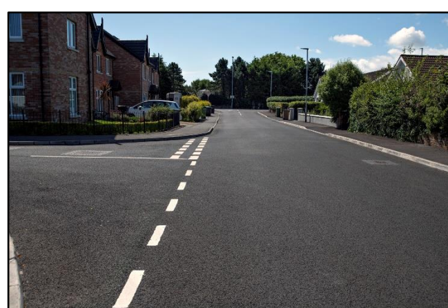
Cotswold Drive, Bangor