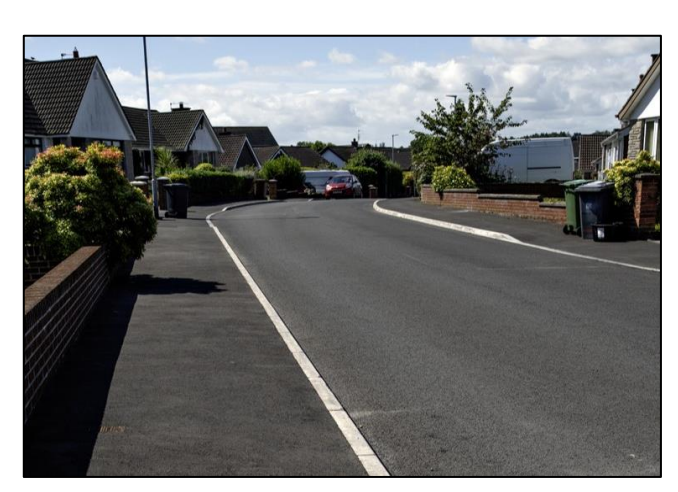
Cotswold Gardens, Bangor